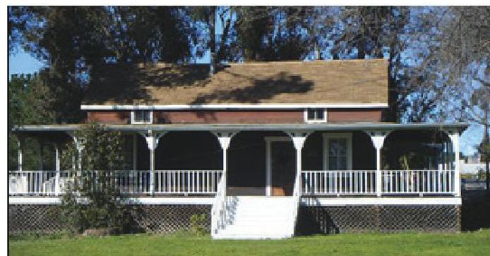
The Beaty House now makes its home at the John DeWitt Historical Society Museum.